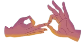
DHARMACHAKRA MUDRA dharma wheel gesture