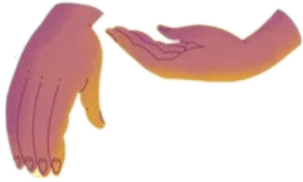
BHUMISPARSHA MUDRA earth touching gesture

CSMVS Children's Museum is supported by BANK OF AMERICA