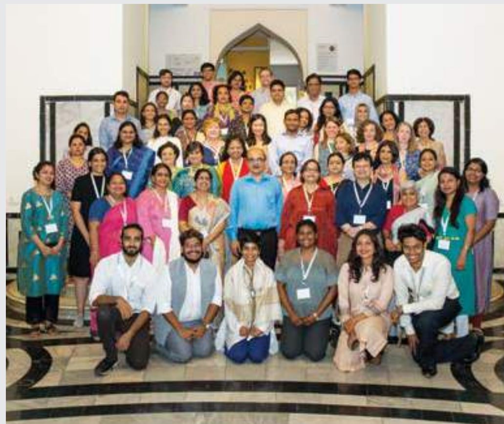
Participants and speakers of the meeting

Accessibility – The focus was on providing a universal design for creating physical and intellectual accessibility. It was pointed that the staff need to be trained to be sensitive to the needs of the differently-abled — in aspects of display, handling as well as interaction. It was suggested that Museum on Wheels could play a major role in providing accessibility. The buzzwords were 'less text, more visuals'.