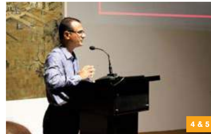
4 & 5