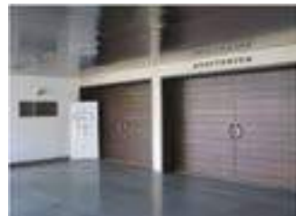
Auditorium, Visitors Centre