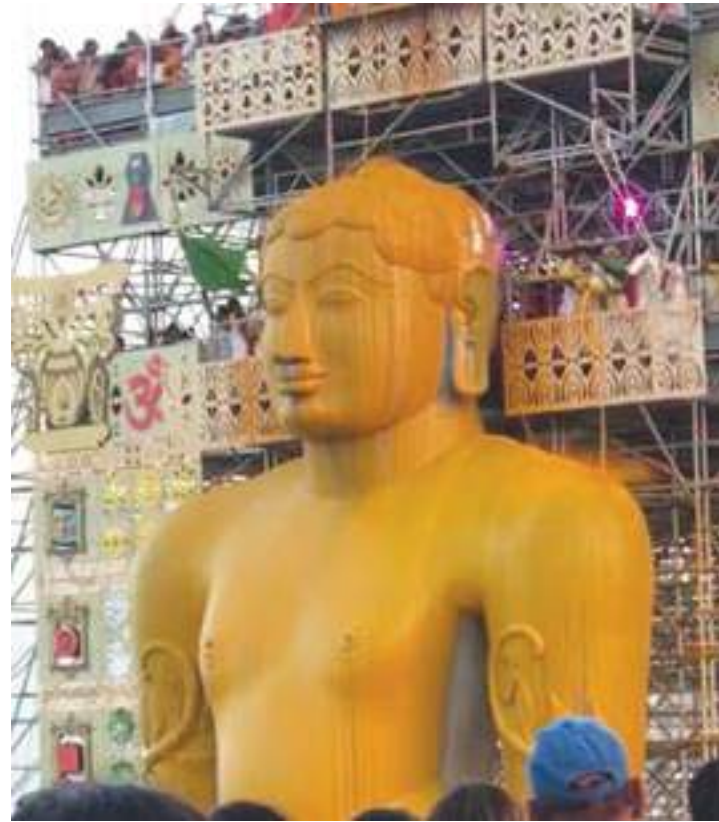
1000 year old (981 A.D.) 58 feet tall monolithic statue of the revered Jain Saint Bahubali (Gomateshwara)