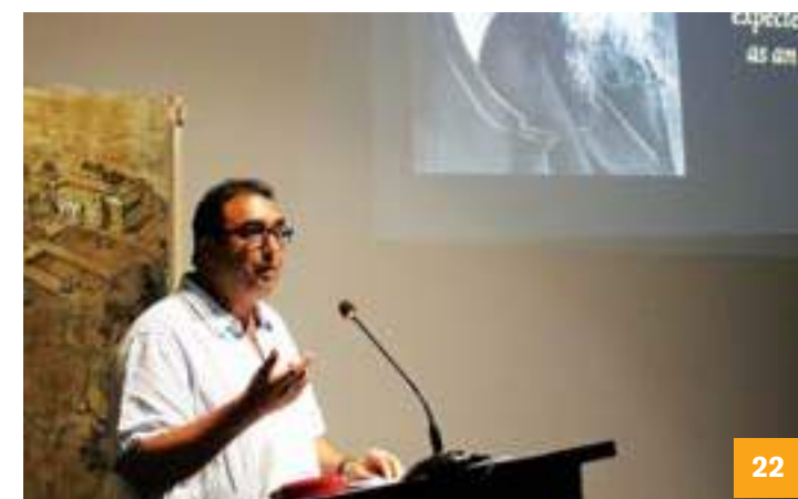
21. Think Big to Think Small: Building Inspiring Museums for Young Museum-Goers May 25, 2018 Supported by Bank of America