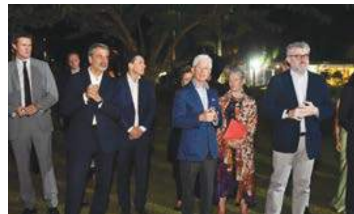
Bizot Group delegates enjoying the evening.