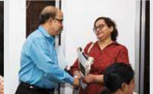
Participants at the group discussion sessions

were representatives of the Bank of America. The impression of brainstorming session was a palpable synergy of thought and approach among the various professionals present at the conference. Some common themes and ideas emerged as a result of a vibrant, rich and fervent exchange between the participants.