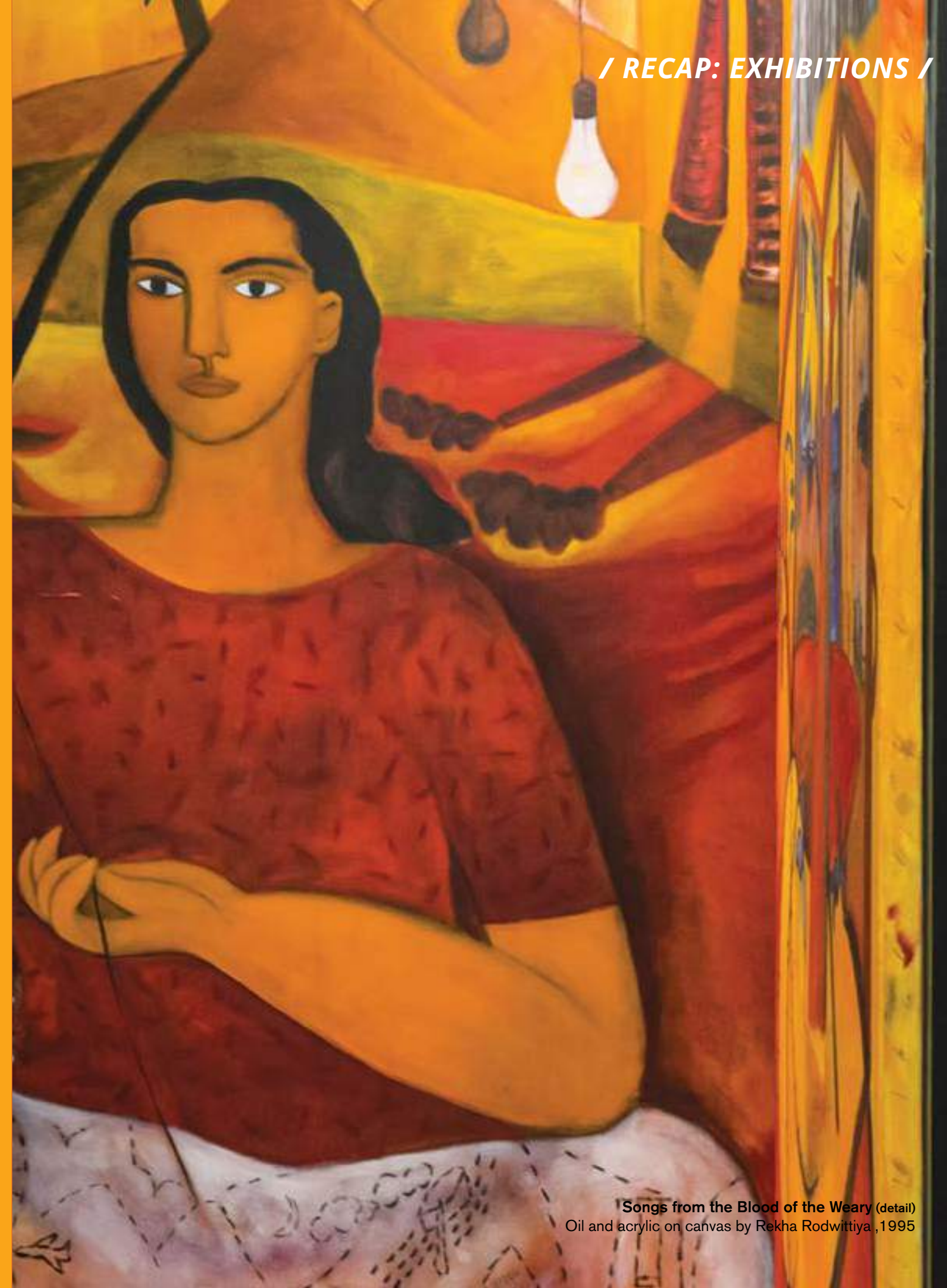
'Songs from the Blood of the Weary' (detail) Oil and acrylic on canvas by Rekha Rodwittiya, 1995