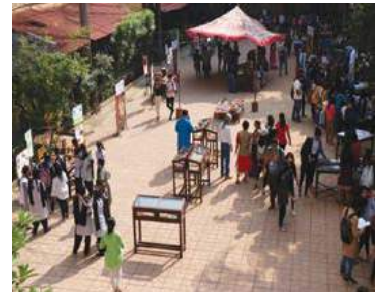
Visitors at the exhibition

January 11-12, 2018: The Museum Society of Mumbai and the Department of Ancient Indian History, Culture and Archaeology, St. Xavier's College (Autonomous), Mumbai, organized the annual departmental festival exhibition Vividha 2018: Kalotsav Craft Traditions of India in "The Woods", St. Xavier's College (Autonomous), Mumbai. The event had a footfall of over 2000 persons and was well appreciated.